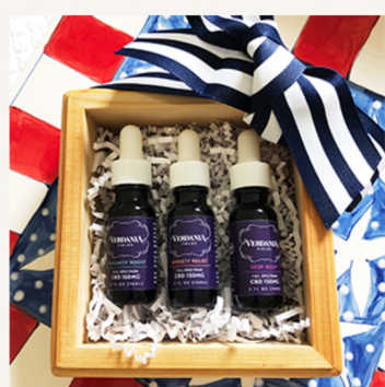
VERDANIA FIELDS ELECTION SURVIVAL KIT

No matter who you plan on voting for, the election is fraught with anxiety. Although times may be uncertain and we're all feeling more stress than usual, relief is available to help us get through the rest of 2020.